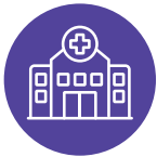
Large Academic Medical Centers

American Mobile has travel nursing assignments in: