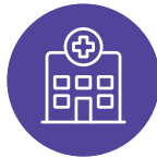
Mid-Size & Smaller Hospitals