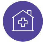
Home Health Companies

You can search our extensive jobs database for openings in your travel nurse specialty, including critical care, emergency nursing, labor and delivery, medical-surgical nursing, the dialysis unit, pediatrics, the cardiac catheterization lab, and more. Any specialty certifications and training can increase the demand for your skills.