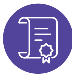
Academic and Research Center