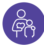
Children's Hospitals / Pediatric Facilities